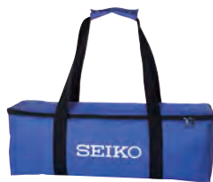
Carrying bag DT-01