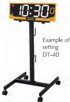
Example of setting DT-40